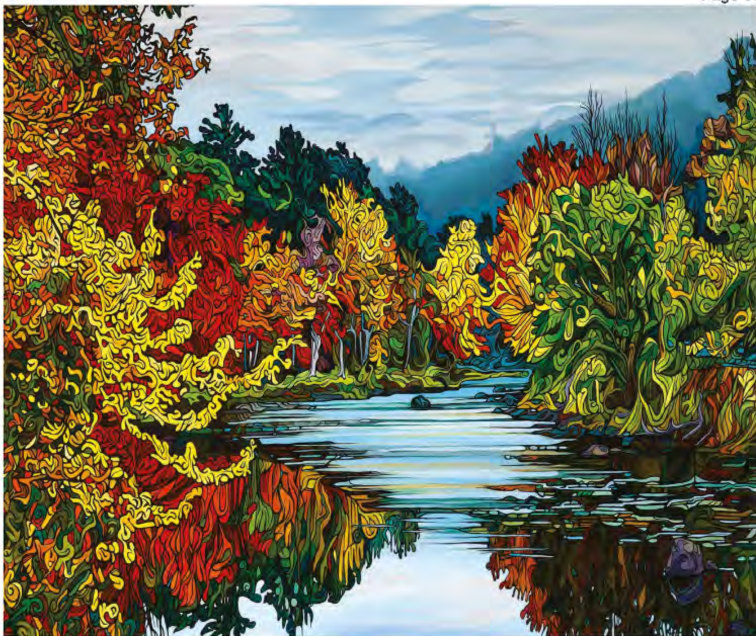
This Page, above, Dawn Illuminates, acrylic on canvas, 24" x 30"

He offers a personal and distinctive style to the world through his bold use of colours and lines, often symbolic images or subject matter. Objects in the paintings retain their realistic appearance yet have a vibrancy and fluidity about them, unique to his work.