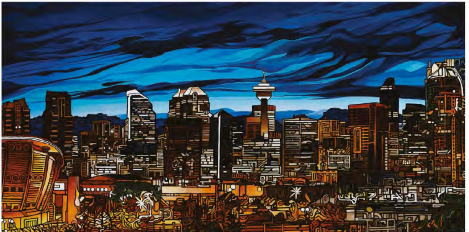
This Page, top, Inconspicuous Roost , acrylic on canvas, 30" x 40"