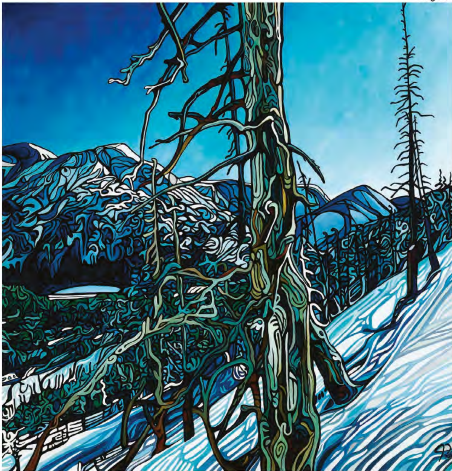
This Page, above, Winter Spell , acrylic on canvas, 30" x 30"