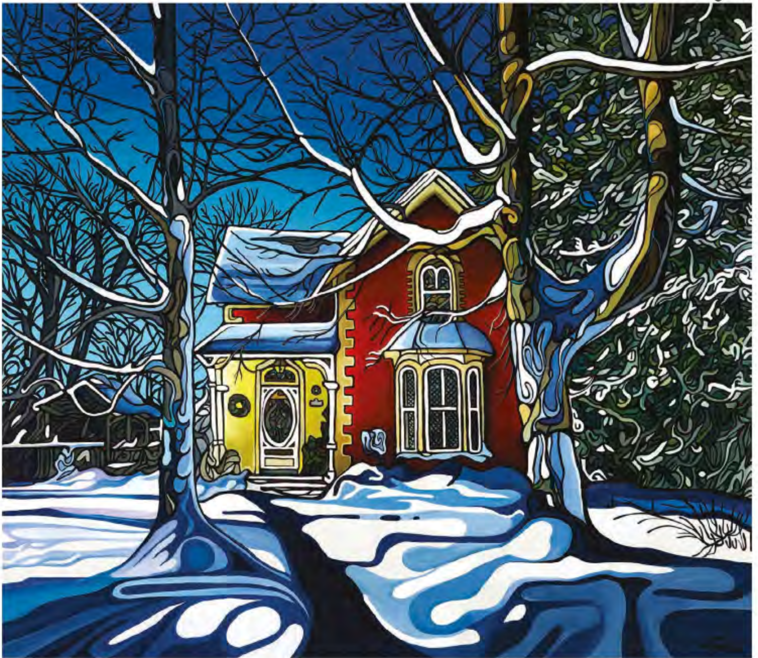
This Page, above, Warm Morning Sun in Winter , acrylic on canvas, 30" x 36"