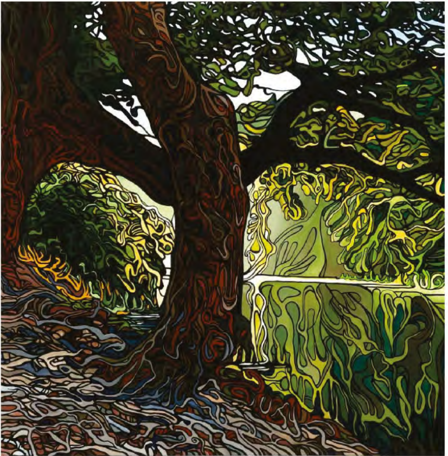
This Page and following page, above, one painting, Reach , acrylic on canvas, 30" x 60"

JEFF DILLON is a fulltime Canadian fine artist located in Waterloo Ontario, Canada. At a very early age Jeff was drawn into the natural world, often wandering in field and forest collecting leaf specimens and learning to differentiate between the plants, wildlife, and birds of BC, Manitoba, and Ontario. This love of nature expanded over the years to include a fascination with the changeable weather patterns of every season.