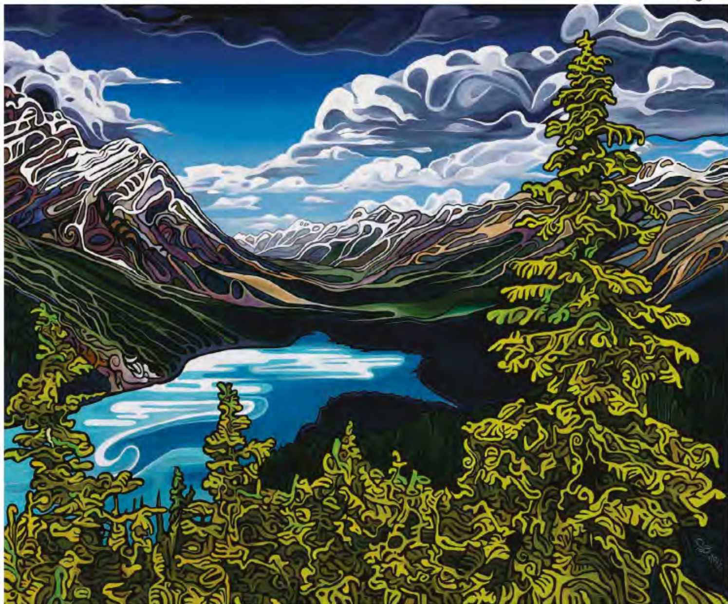
This Page, above, The Path , acrylic on canvas, 24" x 30"