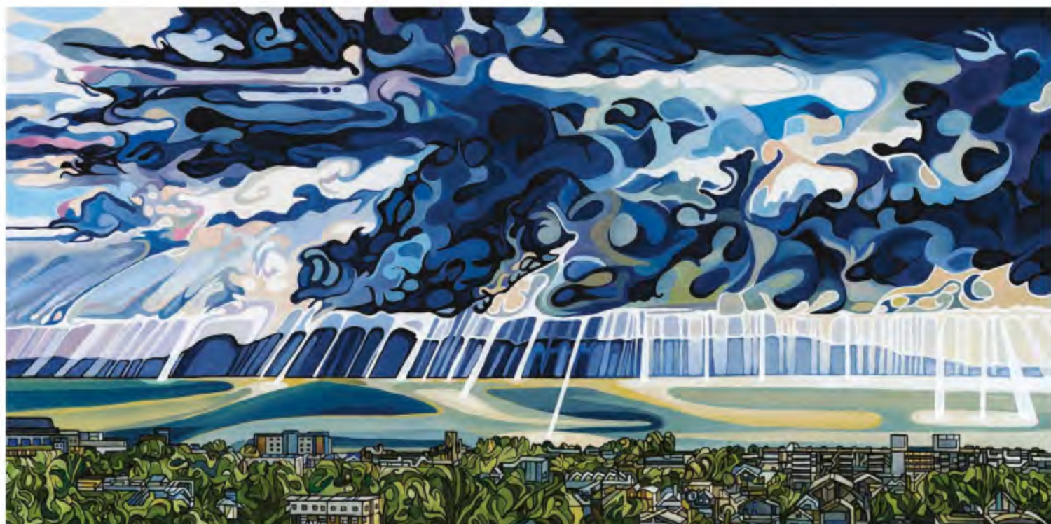
This Page, top, Drifting , acrylic on canvas, 20" x 30"